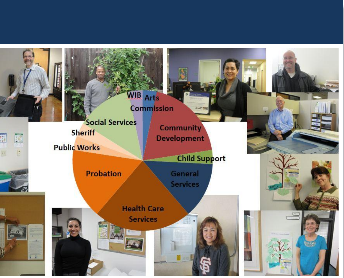
10 County divisions are represented in the Green Ambassadors Network