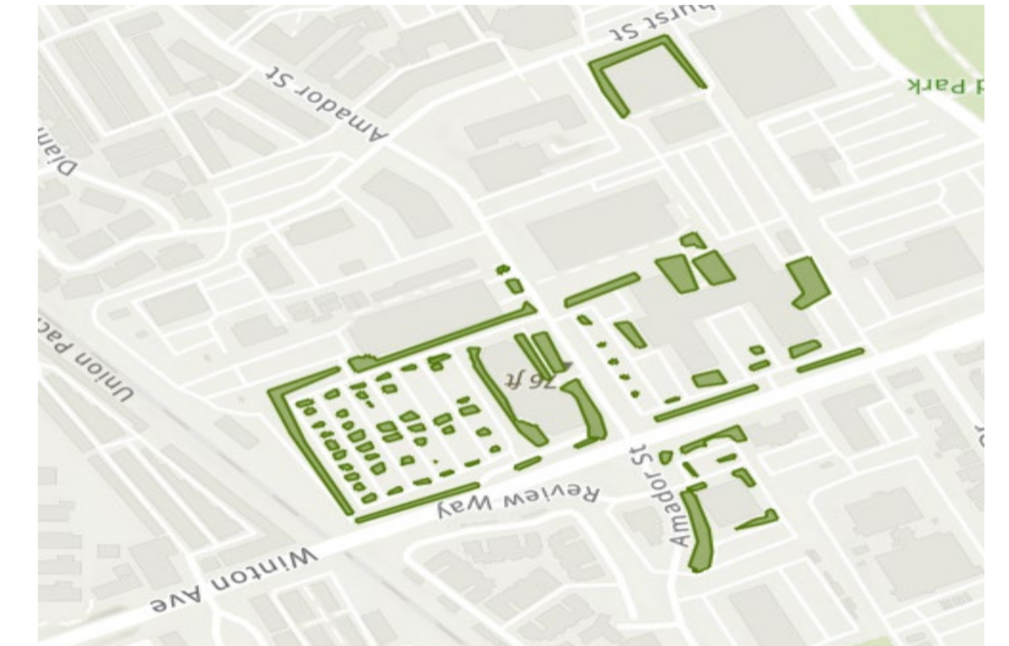
The green on this map is made up of small polygons which isolate potential area to apply compost or mulch.

I collected data quantifying Alameda County's capacity to place compost and mulch on landscapes by using a GIS mapping tool. There is a much higher capacity to accept mulch on County landscapes than compost. Additionally, the County landscapes cannot accept all the material needed to meet our target. From this collection process and the analysis completed by consultants, we learned that we could meet only 50% of the target using County landscapes.