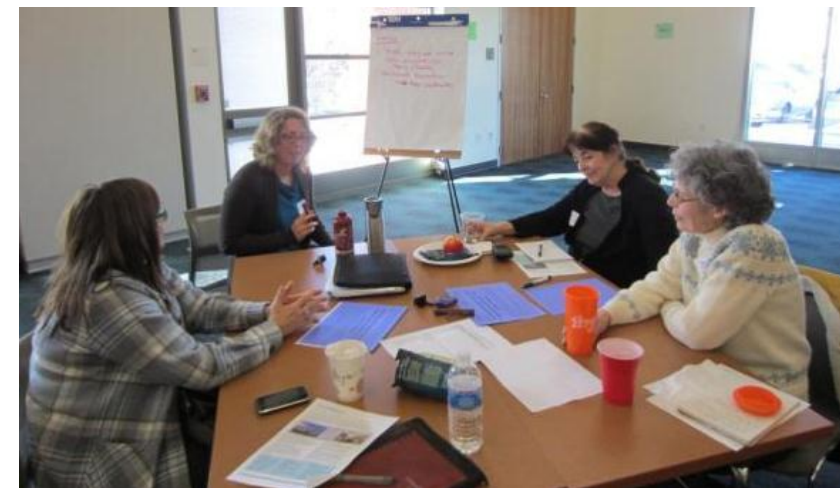
Green Ambassadors designed the campaigns to be adjusted based on feedback from participants and the environment.