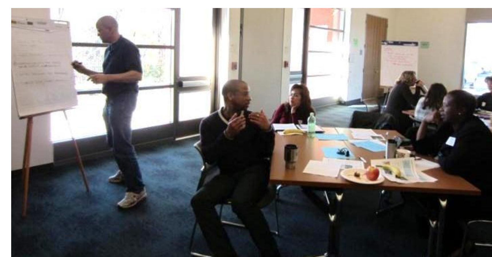
Green Ambassadors design the campaign to encourage individuals to self-organize.