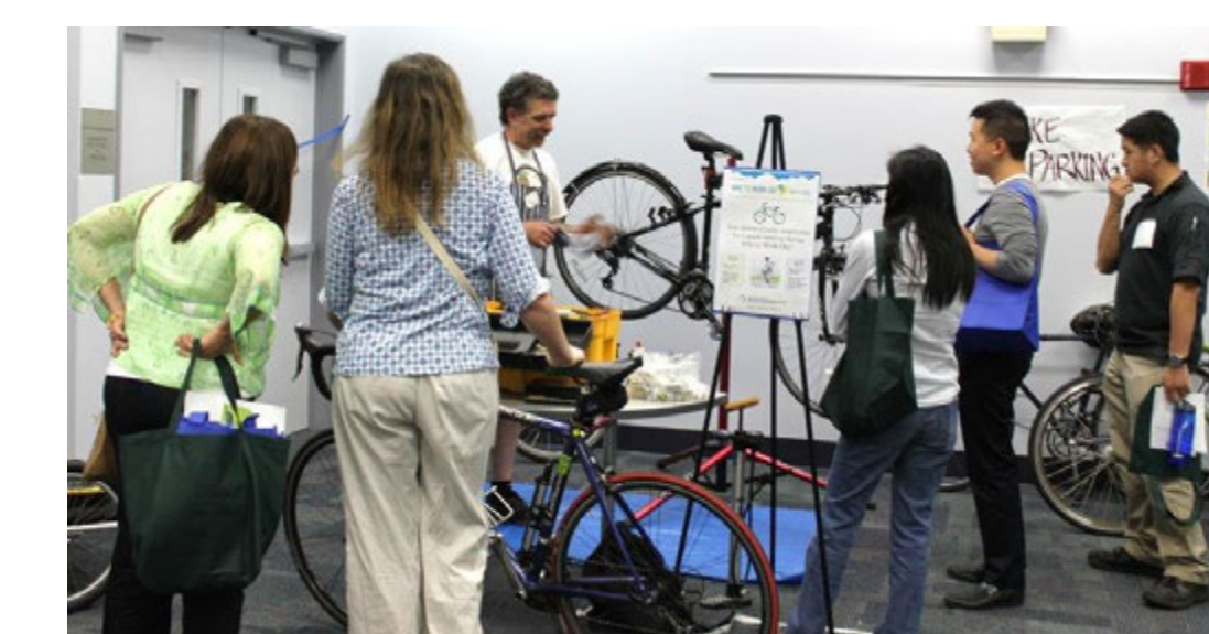
Green Ambassadors and colleagues visit bike repair stand at Clean Commute Fair.