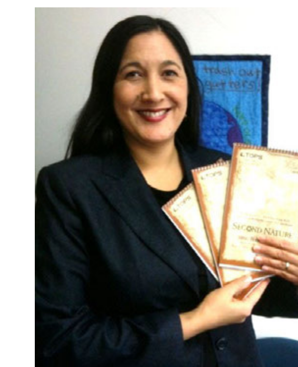
Recycled content office supply photo contest winner