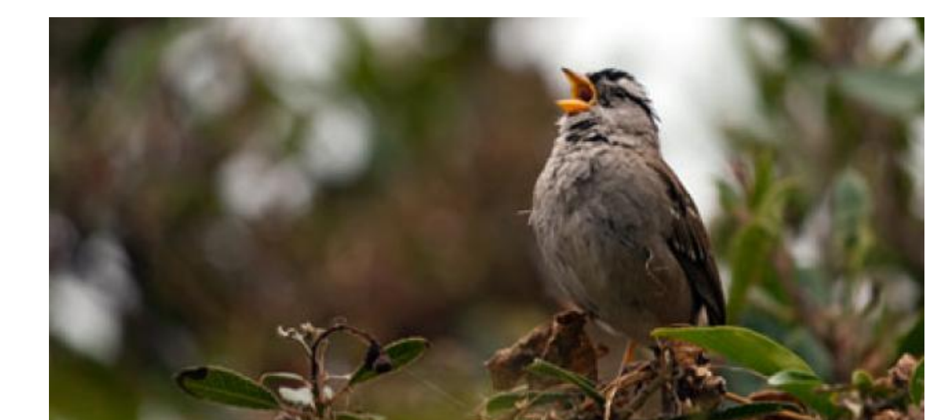
As ambient noise from city traffic has increased, the white-crowned sparrow has altered the pitch of its song to be audible above the din.