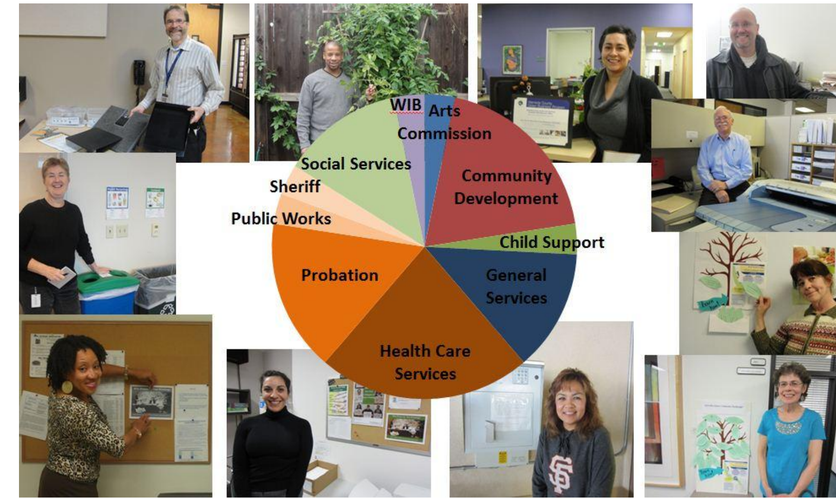
Green Ambassadors are locally attuned to the needs of their department.