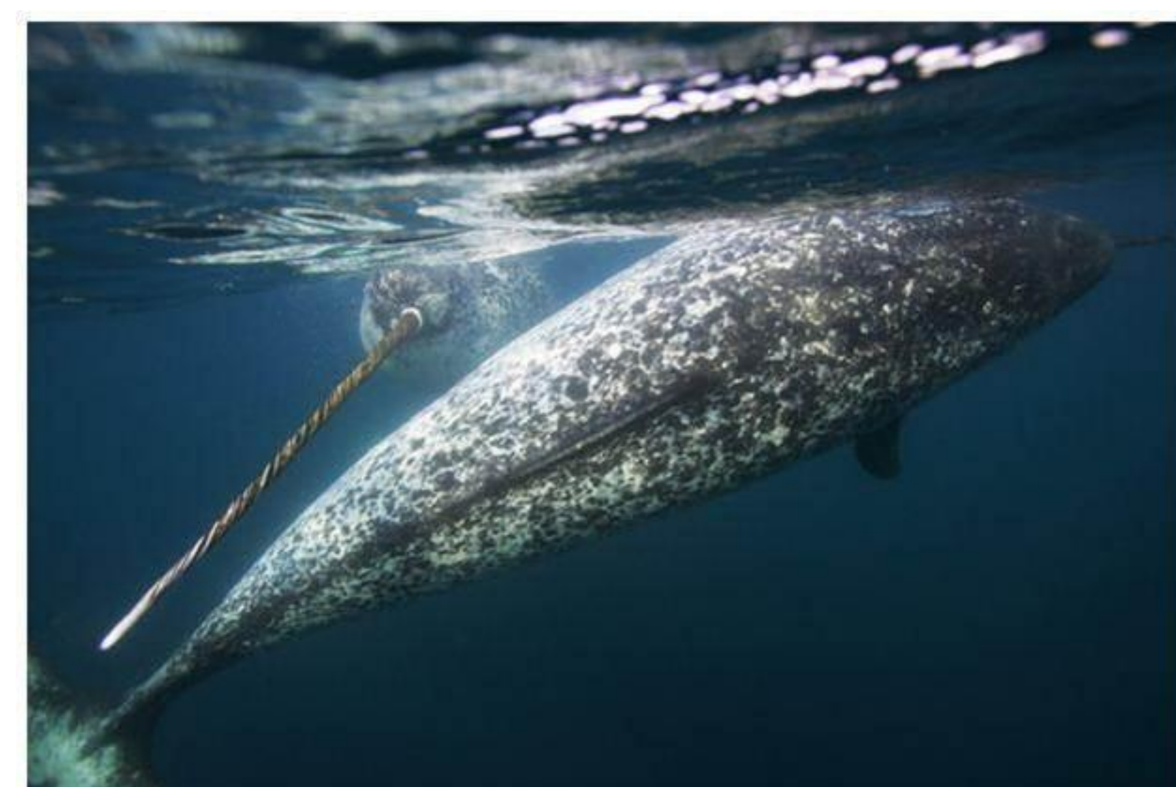
The network members looked to natural champions, such as the narwhal, for inspiration.