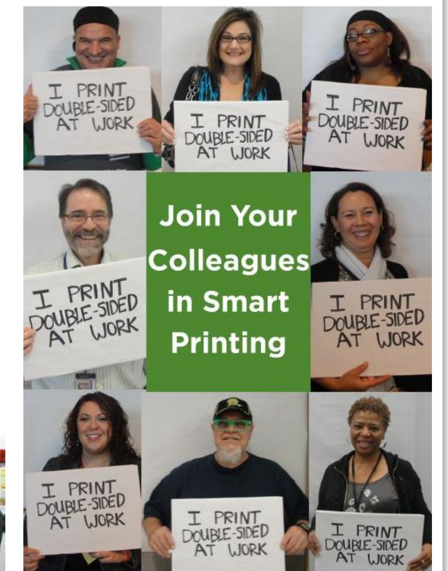
Smart Printing Campaign poster