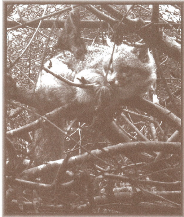
Canine in favorite tree at Sulphur Creek Nature Center in Fairview