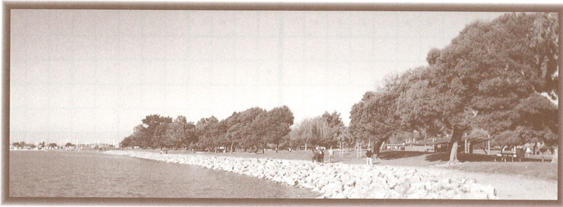
Bay Trail along Marina Park, San Leandro