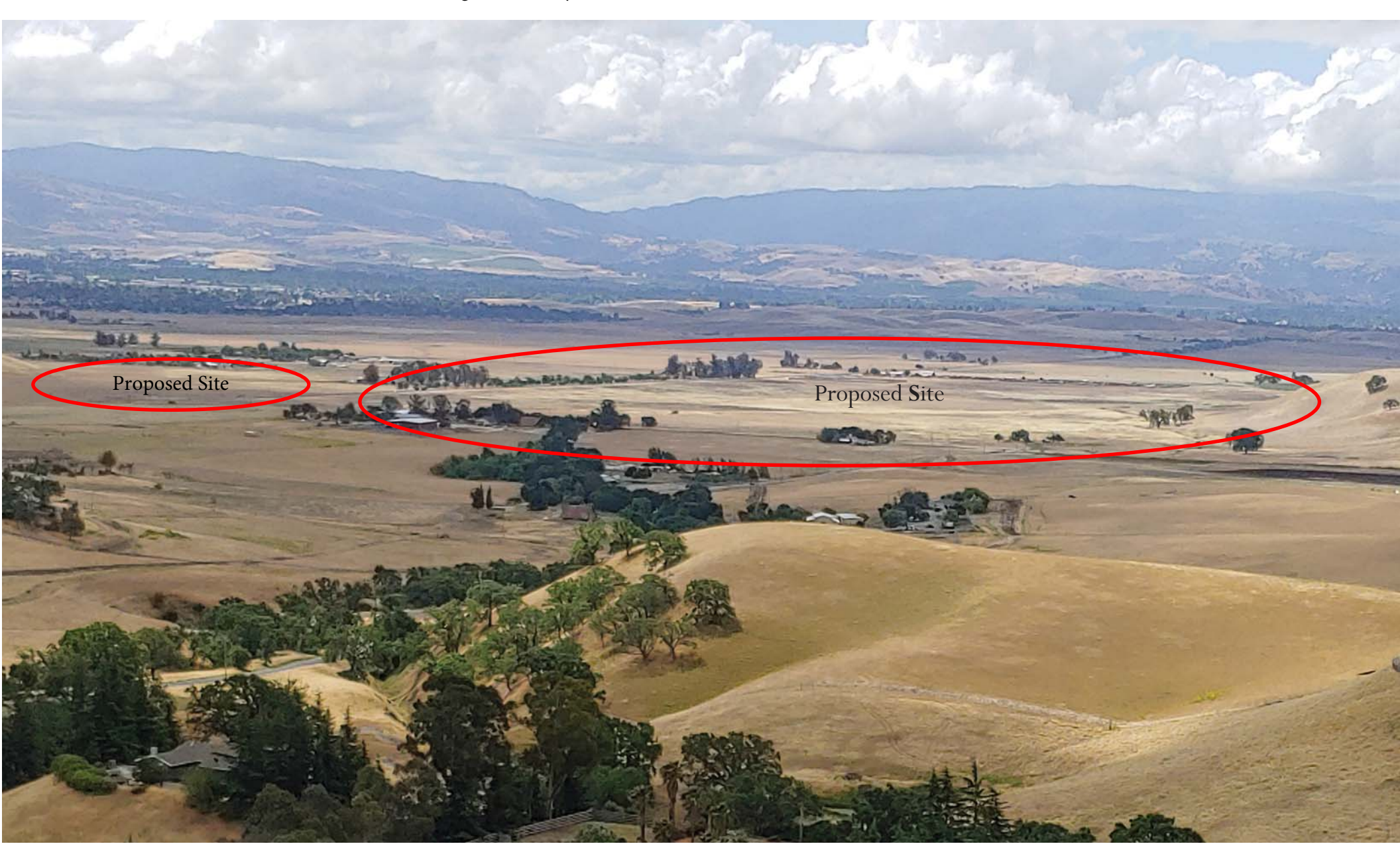
Attachment A - View to the south from Morgan Territory Road