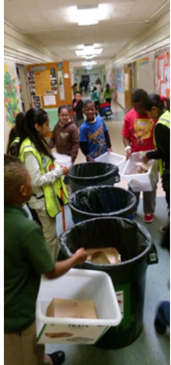
Students in Oakland sort their waste as a part of Green Gloves.