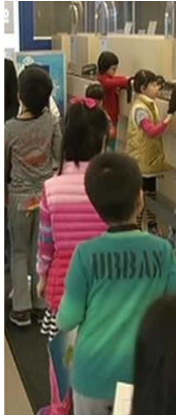
San Francisco kindergarteners in line to open their savings accounts