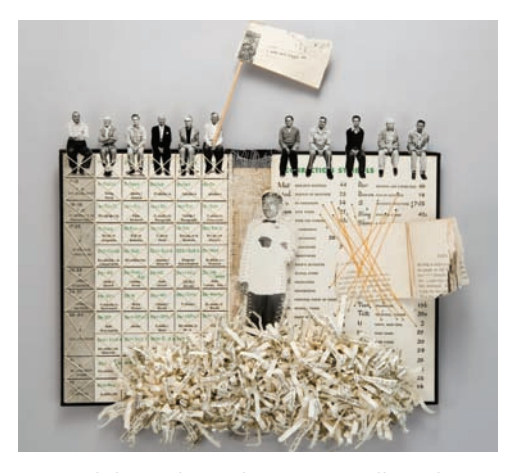
Images of large site-specific and small framed artworks presented throughout the Castro Valley Library.